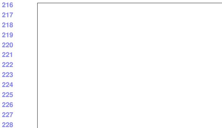
Figure 1. Example of caption. It is set in Roman so that mathematics (always set in Roman: B \sin A = A \sin B ) may be included without an ugly clash.

can report results of other challenge participants together with your results in your paper. For your results, however, you should not identify yourself and should not mention your participation in the challenge. Instead present your results referring to the method proposed in your paper and draw conclusions based on the experimental comparison to other results.